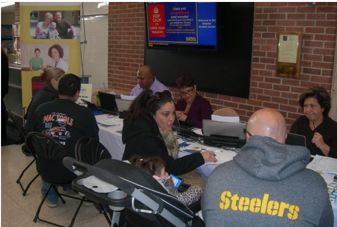
NSHC navigators answer questions, review health plan choices, and enroll individuals at a community health fair on Saturday, November 15, 2014. The fair was organized by John T. Mather Memorial Hospital. Hundreds of similar enrollment events took place throughout the state on Day One of Season Two.

Under the Affordable Care Act (ACA), individuals and businesses with 100+ employees must obtain health insurance by January 1, 2015 or face penalties. Enrollment in Medicaid and Child Health Plus continues throughout the year. The NY State of Health Small Business Marketplace for employers with 50 or fewer employees is open for enrollment throughout the year.