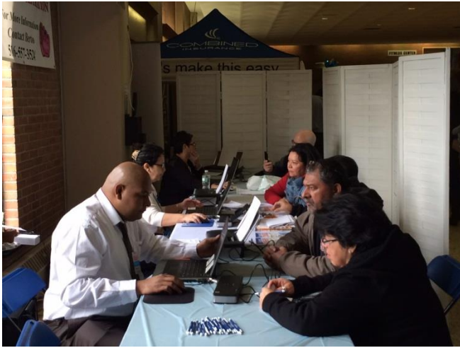
Certified navigators from the Nassau-Suffolk Hospital Council, one of Long Island's lead enrollment agencies, meet with applicants during a recent enrollment fair.

Navigators process rush of applications in final days leading up to marketplace's closure